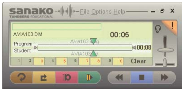
SANAKO Lab 300 Media Assistant Duo Student User Interface