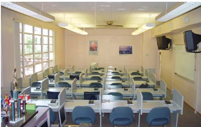
SANAKO Lab 100 offers a wide variety of exercises for group or individual activity.