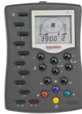
SANAKO Lab 100 User Audio Panel

The Bartram Campus also offers an extensive language program of Spanish, French, German and Latin and will use the Tandberg IS-10 language lab installed in August 2003.