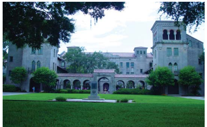
The Bolles was the first school in Florida to purchase SANAKO Lab 100.