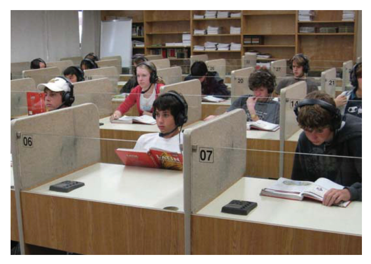
Students are exposed to many different stimulating activities in SANAKO Lab 100.

Our SANAKO language lab is not only a fun way to spend a class period but it's also a very beneficial and efficient way to use instructional time teaching Latin.