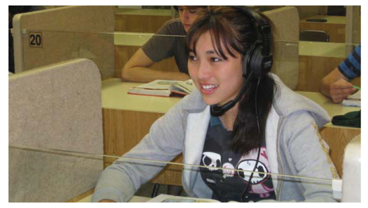
Students at Miramonte have found that they can breathe new life into Latin using SANAKO Lab 100