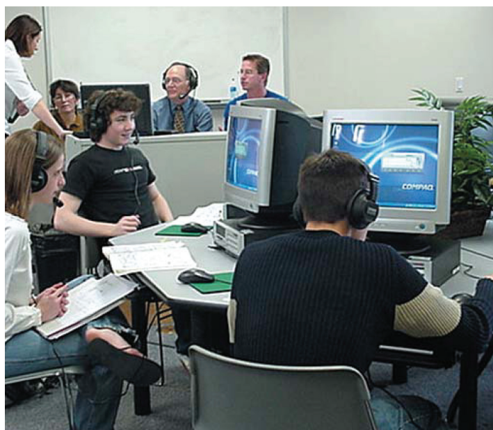
SANAKO Lab 300 helps students and staff achieve excellence.

Located in Addison, Texas, Greenhill School is a coeducational private day school with an enrollment of more than 1,200 students, Pre-K through Grade 12. It is a diverse community of learners that strives for excellence; values individuality; fosters a passion for learning; promotes the balanced development of mind, body, and character; encourages service, and instills a respect for others.