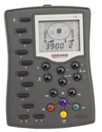
SANAKO Lab 100 User Audio Panel

SANAKO Lab 100 is a versatile language learning center that only requires one computer - the teacher's. Students are equipped with durable, low cost and simple to operate User Audio Panels with high-quality digital audio that is ideal for language learning.