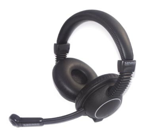
Headset SLH 07

Microsoft, Windows, Windows Vista and the Windows Vista Start button are either registered trademarks or trademarks of Microsoft Corporationin the United States and/or other countries.