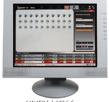
SANAKO Lab 100 Software